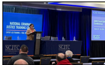
Honorable Audrey Skwierawski (Director of State Courts, WI Court System)