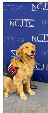
Left: K9 Hawk Top: Smiles from NCJTC Associates registering attendees Bottom: Conference Sponsor, Ironwall by Incogni, networking with attendees