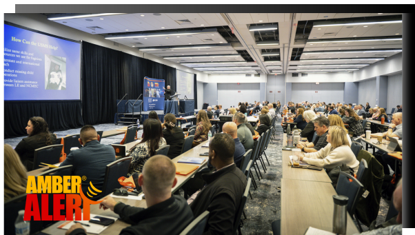
Image from the National AMBER Alert Symposium