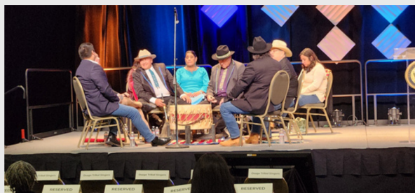
The Oscar-nominated Osage Tribal Singers kicking off the event