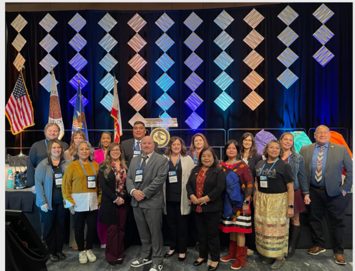
NCJTC team at the conference!