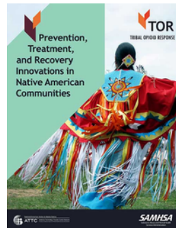
Prevention, Treatment and Recovery Innovations in Native American Communities

Together, we can break the stigma and foster a community that prioritizes mental well-being for all.