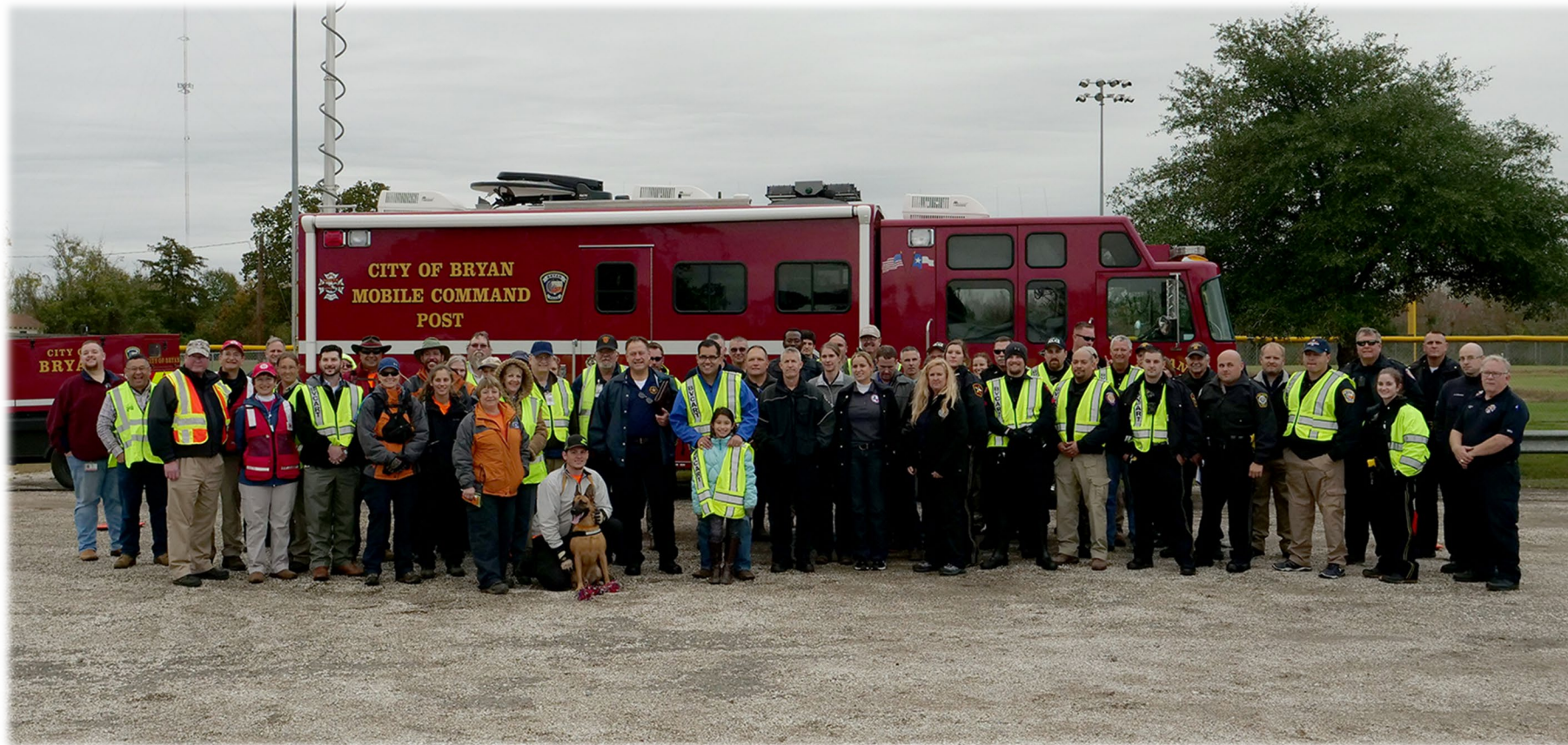
2018 CART Implementation Guide-Fox Valley Technical College- AMBER Alert Training and Technical Assistance Program.