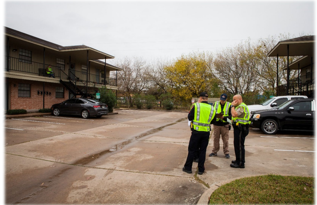
2018 CART Implementation Guide-Fox Valley Technical College- AMBER Alert Training and Technical Assistance Program.