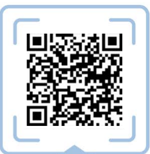
Family Survival Guide

Trusted, timely, & actionable information—at your fingertips.