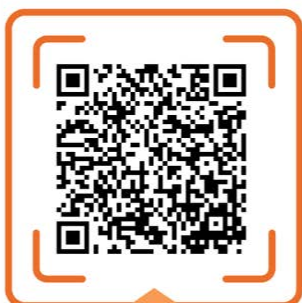
Indian Country (AIIC) courses