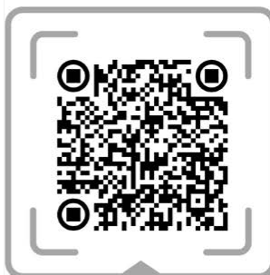
AMBER Alert resources