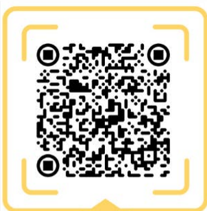
Find AMBER Alert partners