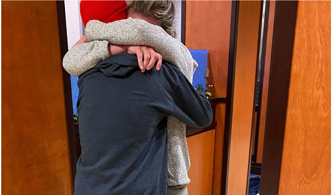
The abducted teen is shown reuniting with his mother after his ordeal.