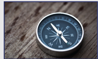
Law Enforcement Administrative Professionals Training Conference

For details about our conferences, scan the QR code or visit ncjtc.org/conferences