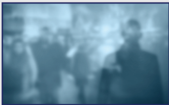
National Missing and Unidentified Persons Conference