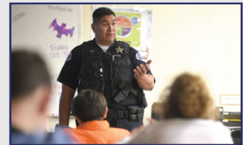
School Resource Officer Training Conference