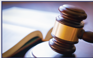
Court Safety and Security Conference