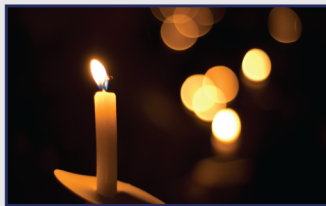
Wisconsin Serving Victims of Crime Conference