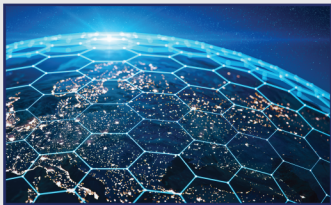
NEW National Internet of Things (IoT) Investigative Conference