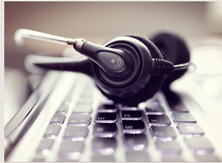
Recorded Webinar Library

Drug Identification and Recognition: The Opioid Crisis in America