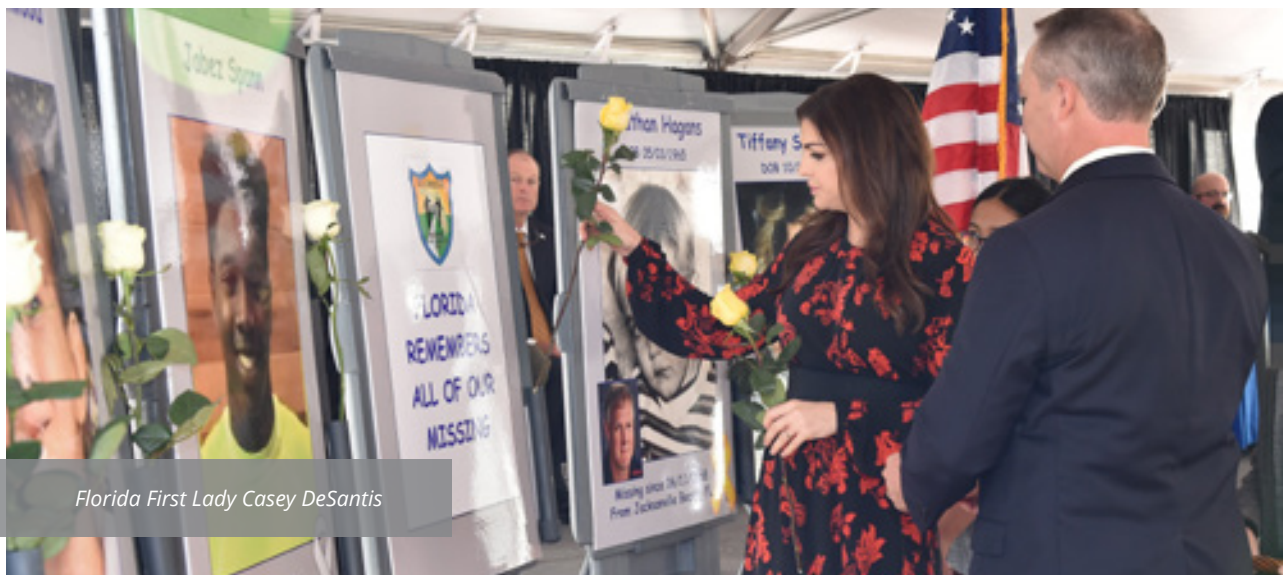
Florida First Lady Casey DeSantis