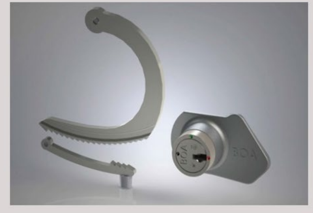
SPRING COMPRESSED Cuffs Jaw is open for cuff removal