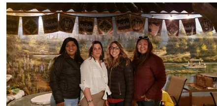
Wampanoag Tribe of Gay Head And Unified Solutions