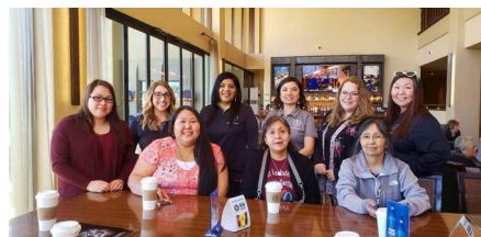
Emmonak Women's Shelter and Unified Solutions