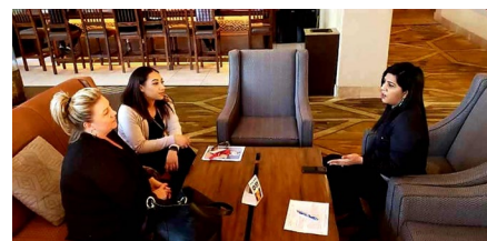
Kalispel Indian Tribe and Unified Solutions