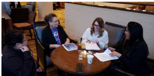
Ft. Peck Assiniboine & Sioux Tribes and Unified Solutions