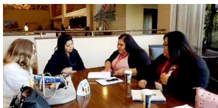
Quechan Indian Tribe and Unified Solutions