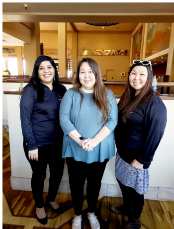
Aleutian Pribilof Islands Association, Inc and Unified Solutions

Unified had a wonderful time meeting, collaborating, and providing Training and Technical Assistance to so many of our wonderful Grantees in sunny Tucson in late January 2020. To all of our Grantees, it is always a pleasure to see you in person. We are honored to serve you!