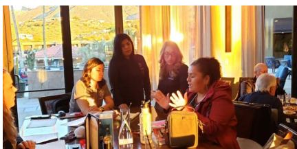
Fort McDowell Yavapai Nation and Unified Solutions