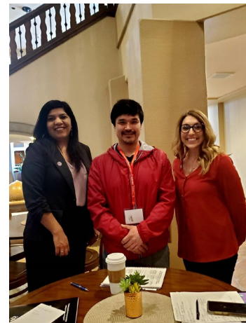
Akiak Native Community and Unified Solutions