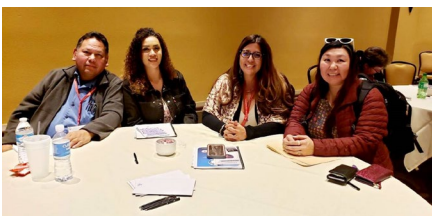
Pascua Yaqui Tribe and Unified Solutions