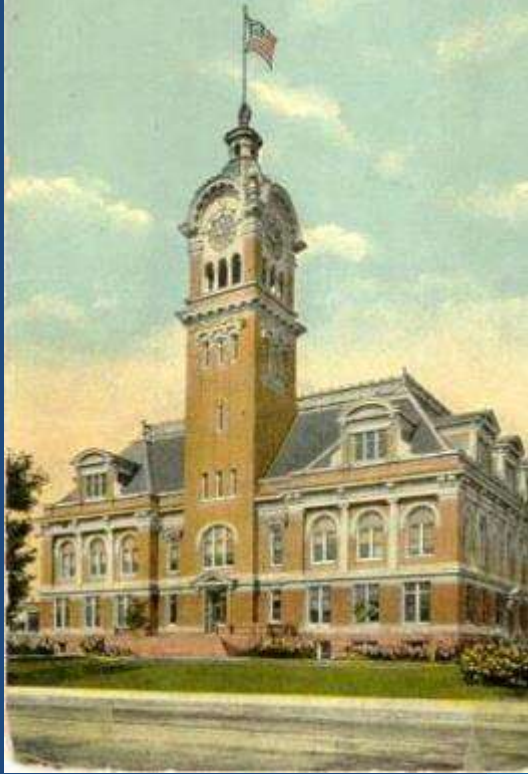
Lincoln County Court House, Merrill, Wis.