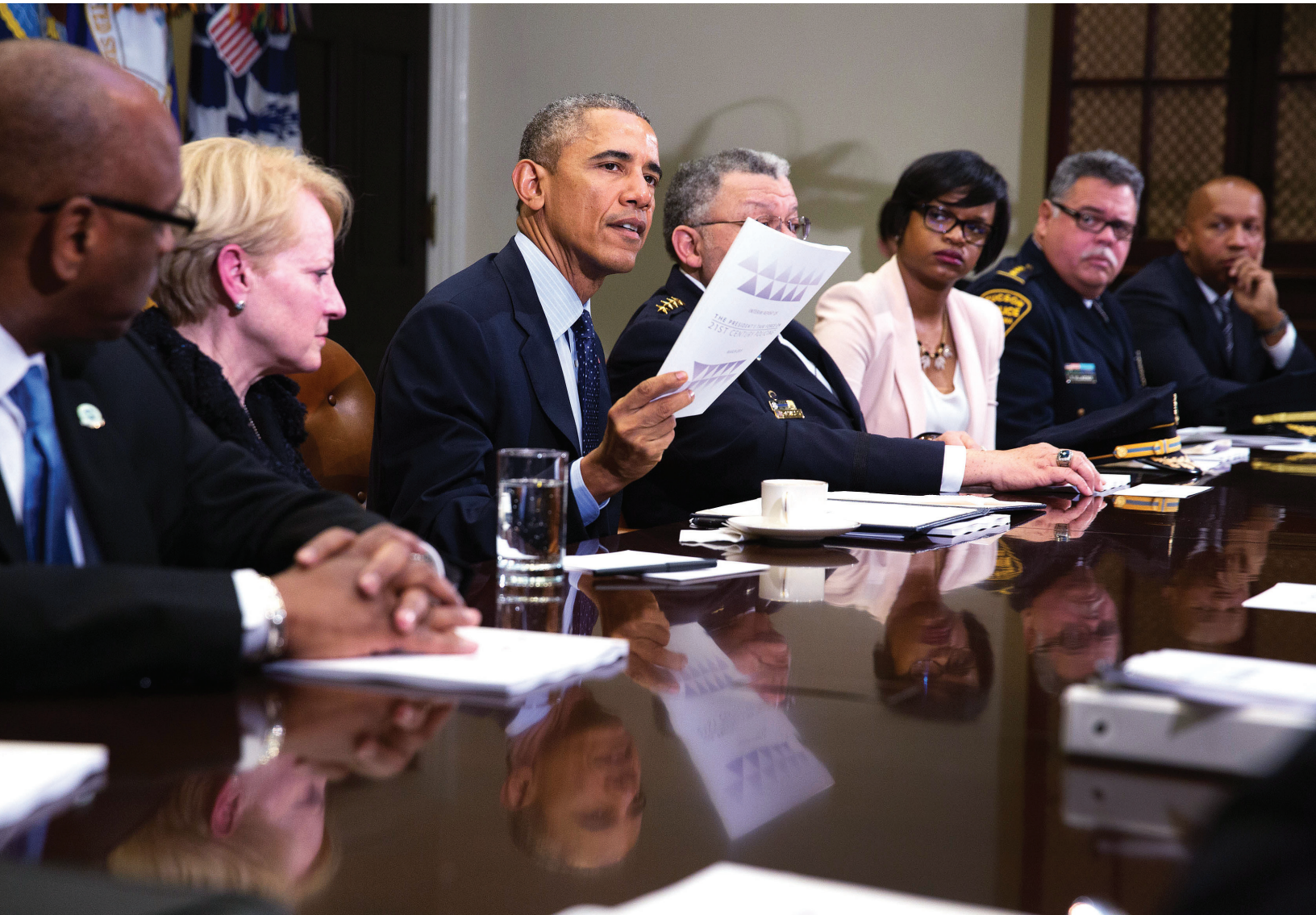
President Barack Obama delivers remarks to the press following a meeting with members of the President's Task Force on 21st Century Policing in the Roosevelt Room of the White House, March 2, 2015.