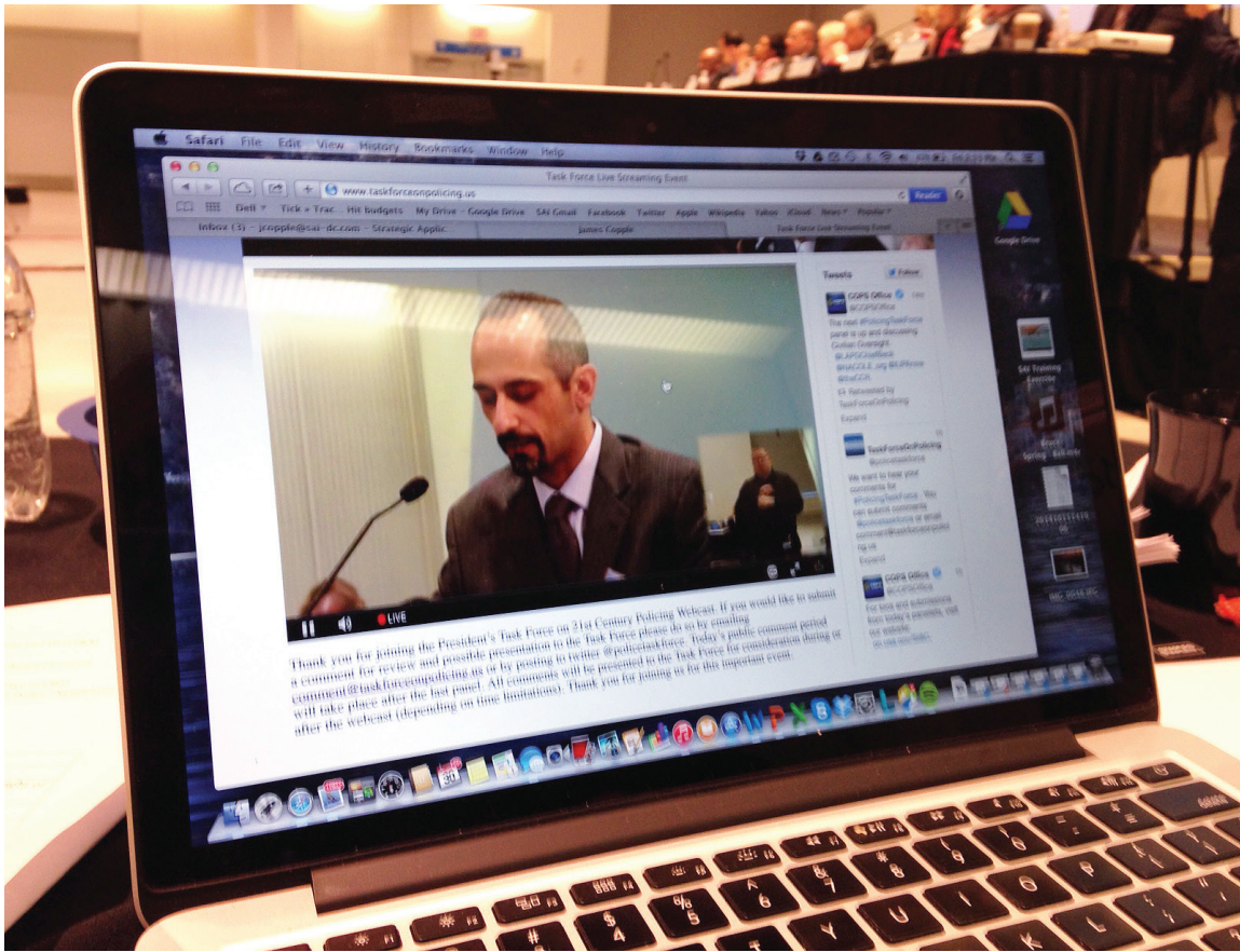
All of the task force listening sessions were streamed live and can still be viewed at the task force website.