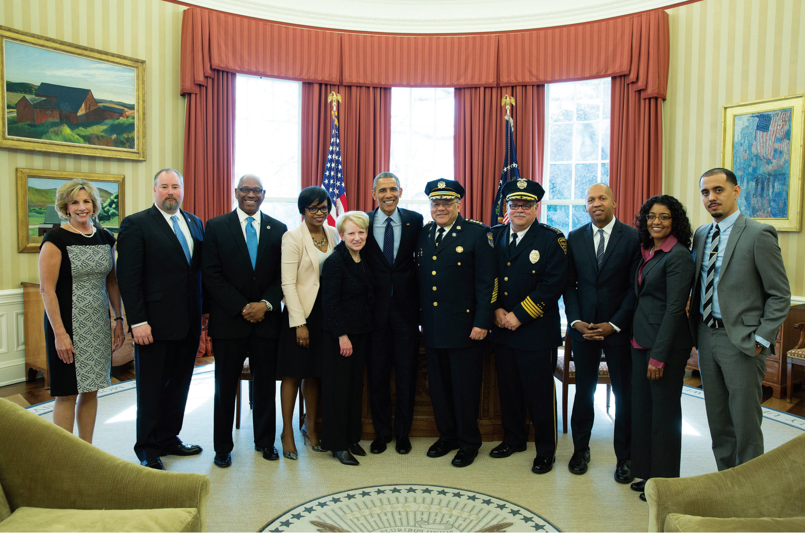
President Barack Obama joins members of the President's Task Force on 21st Century Policing for a group photo in the Oval Office, March 2, 2015.