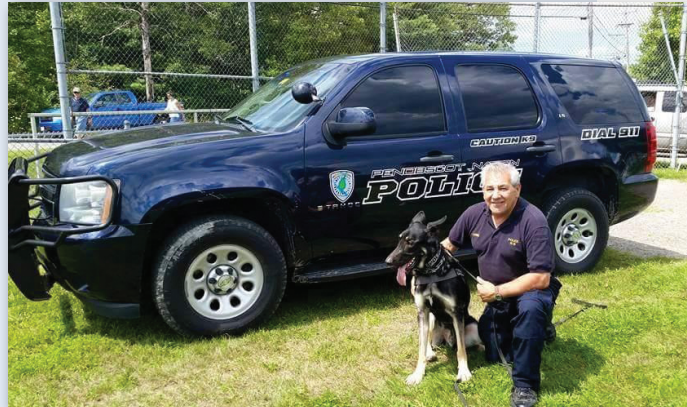
An officer and a K-9 of the Penobscot Nation Police Department pose with their vehicle. The Penobscot Nation PD involved tribal members in choosing departmental vehicles and designing livery and logos (see sidebar p. 28).

The Penobscot Nation Police Department recently hosted a training with Canine Services of Maine to certify canine handlers. Recognizing the interest in the topic, the Penobscot police chief invited other tribal, local, state, and federal agencies to attend. The visiting trainees got to experience working with a tribal community, culture, and jurisdiction, many for the first time. Community members, who were initially uncomfortable with the outside law enforcement presence on the reservation, came to understand the value of having this multijurisdictional group of trained canine handlers to help fight drug issues on and around the reservation. In addition to its primary mission of detecting and deterring illegal drugs, the canine program became a way for participants to network and learn from each other.