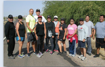
Members of the Fort McDowell Police Department participating in the 2014 Law Enforcement Torch Run for Special Olympics.

The Fort McDowell Police Department is an active member of the tribe's Wellness Court team, a diversion program for adults and juveniles with alcohol- and drug-related infractions. The police department works with other tribal partners to offer training on the drug court philosophy and on addiction and recovery to help officers better understand the participants' treatment goals and to support positive outcomes. Police officers are voting members of the treatment team, in which role they review and provide feedback on treatment plans for participants. With evenings and weekends being peak times for participants to return to using drugs and alcohol, the officers' ability to provide wellness checks outside of typical office hours is essential to the program's success. The goals of wellness check visits are to develop trust between law enforcement and Wellness Court clients and to support the clients' recovery and compliance with court mandates. The Wellness Court continues to be an effective collaboration with the police department and is highly supported by the chief judge.