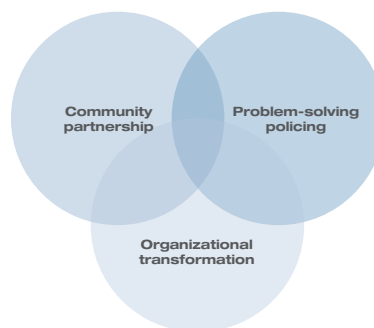
Figure 1. Elements of community policing

Partnerships between the police and the tribal leadership, tribal organizations, and community members can be used to develop collaborative solutions to anticipated challenges and improve trust between the police and those they serve. Other partners may include state or local government agencies, local community groups and service providers, private businesses, and the media.