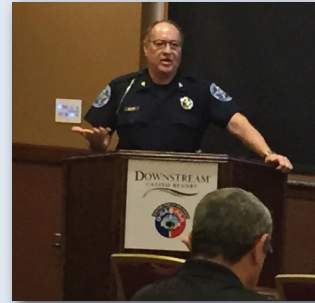
Chief Wesley of the Lighthorse Police Department delivers an April 2016 presentation on community policing.

Support goes both ways; with the tribal governor's encouragement, the Chickasaw Lighthorse Police are often called upon to share equipment, assist with missing person searches, and offer other services to non-tribal agencies. Their reputation for readily and capably providing assistance not only strengthens their agency partnerships but also builds the Chickasaw tribal members' trust that their police department is a strong and supportive resource.