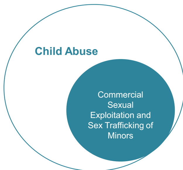
FIGURE 1 Commercial sexual exploitation and sex trafficking of minors are forms of child abuse.

NOTE: This diagram is for illustrative purposes only; it does not indicate or imply percentages.